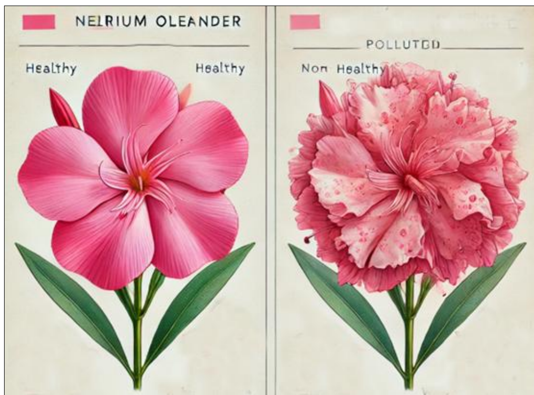
Fig 2: Comparative diagram of floral morphology of Nerium oleander flower in polluted vs. non-polluted area

A statistical study evaluated various morphological parameters related to floral morphology changes in N. oleander that resulted from air pollution exposure. The analysis measures four characteristics of flowers such as petal dimensions and both reproductive organs' development and floral symmetry as