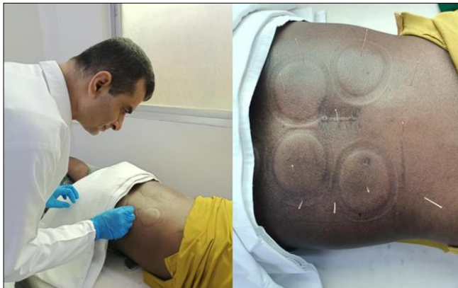
Fig B: MRI of cervical spine revealing PLID

Mobilization, manipulation, and stretching of the lumbar spine, in addition to acupuncture of the lower back, are often utilized as the initial lines of defense in the treatment of low back pain. Acupuncture of the lower back is also sometimes used. One of the treatments that we do is a mix of lumbar mobility and manipulation, and this helps to put the patient at ease. The results of the follow-up inquiry were encouraging, and the inferences that were derived from those findings were likewise, on the whole, good. After receiving acupuncture on his lower back for the fourth time, the patient's health improved noticeably, indicating that the treatment was effective. When the patient's chronic pain in his lower back mysteriously started to alleviate all of a sudden, he was taken aback.